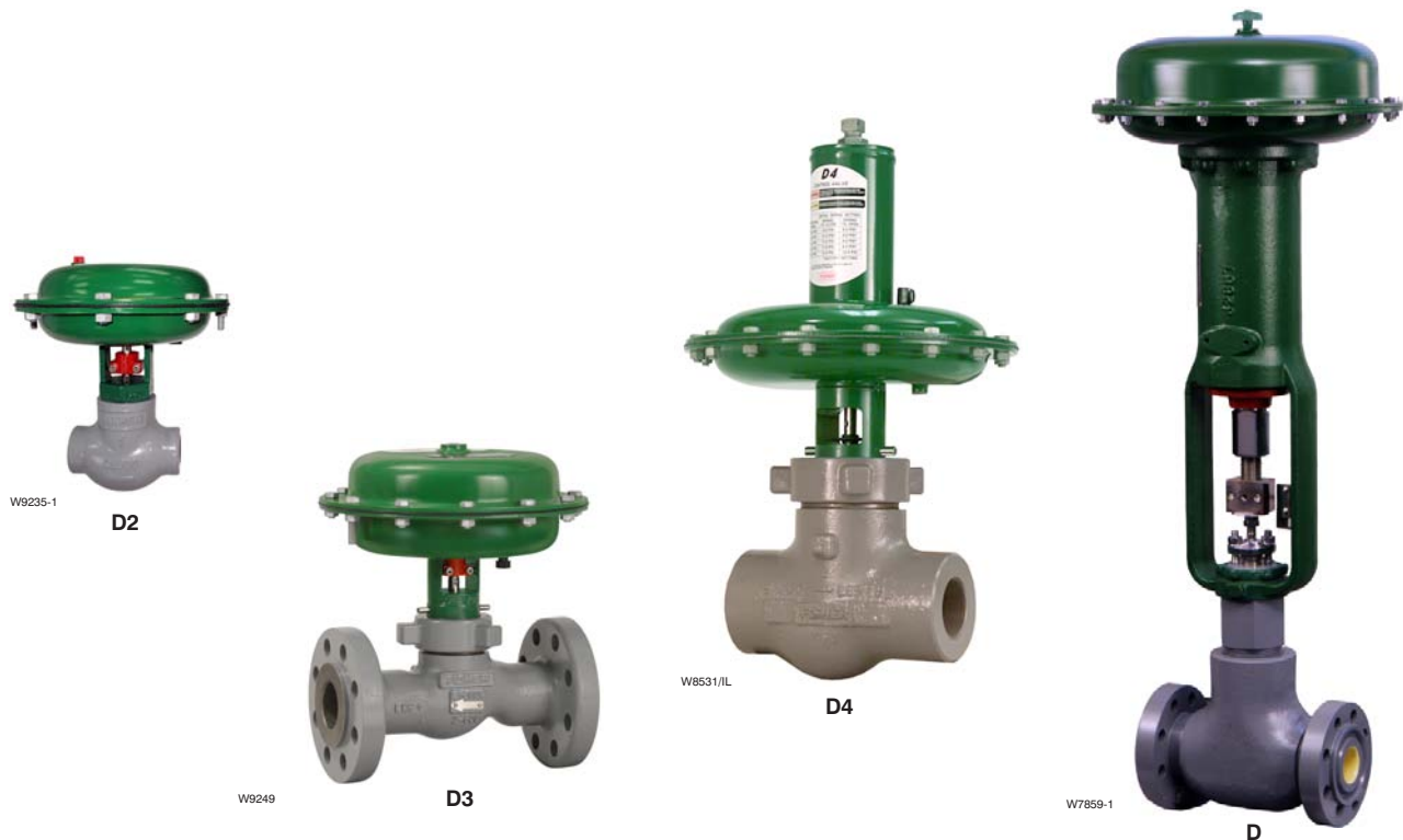
Figure 1. Typical Fisher® D Series Control Valves

The D Series control valve is most typically used in a variety of upstream oil and gas production applications.