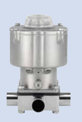
Multi-port diaphragm valve type 2036

The secret of the patented design of the Robolux valve lies in the capability of realizing two independent process switching functions with one diaphragm. This reduces installation expense and complexity, eliminates the need for T-connectors and minimizes the number of valves and diaphragms that would otherwise normally be required. The innovative multi-port valve improves process design, particularly in which valuable products are handled and in which the plant footprint is an issue.