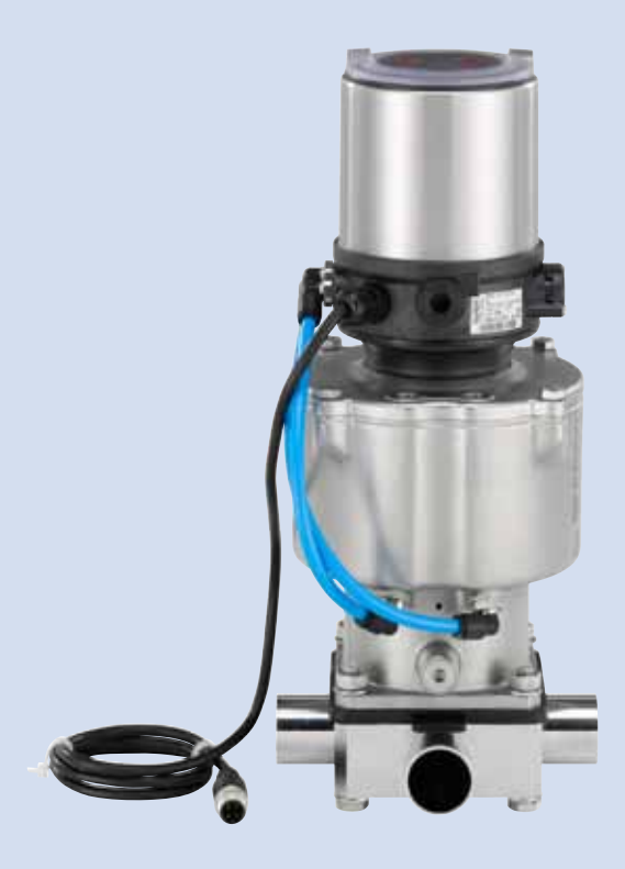
Robolux with control head