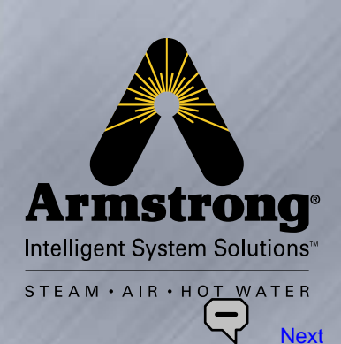
Table of Contents Model Number Index Instructions for Use